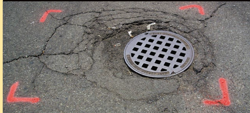
^ Before v After