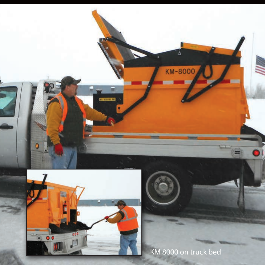
KM 8000 on truck bed