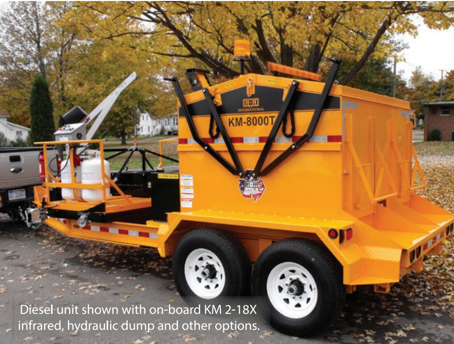
Diesel unit shown with on-board KM 2-18X infrared, hydraulic dump and other options.